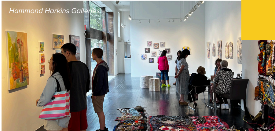
Hammond Harkins Galleries