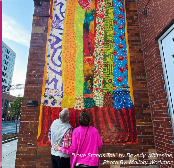
"Love Stands Tall" by Beverly Whiteside.